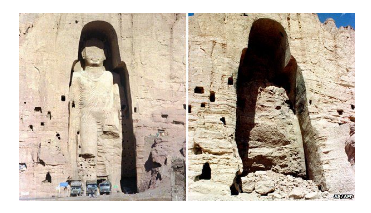
Photos of the 3<sup>rd</sup> century Bamiyan Buddha statue in Afghanistan, before (left) and after (right) destruction by the Taliban.

If you are having personal issues that may affect your academic performance, please let me know in advance and schedule an appointment to meet in office hours so that we can address any concerns. I always strive to be accessible, approachable, and understanding, and I am happy to help in any way that I can!